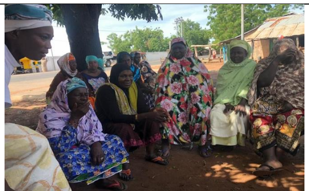
Consultations with an exclusively women's group in Pirang village