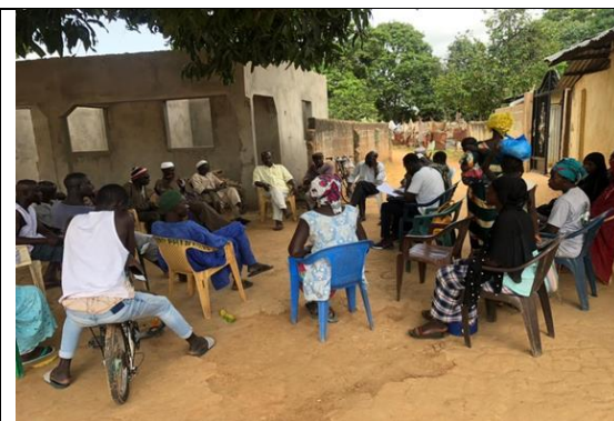
Focused Group discussions in Choya